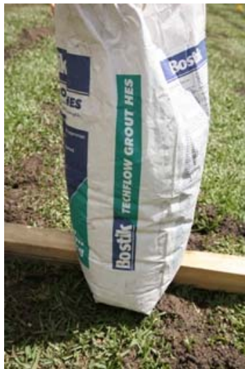
Bostic Techflow HES grout.

These are available from specialist hardware stores. Never use quick set cement or similar cement products. Your fence WILL fail using these products.